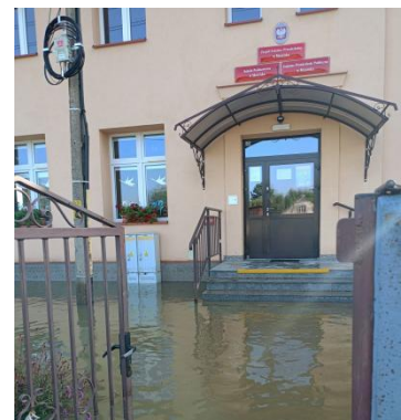
School in Mościsko